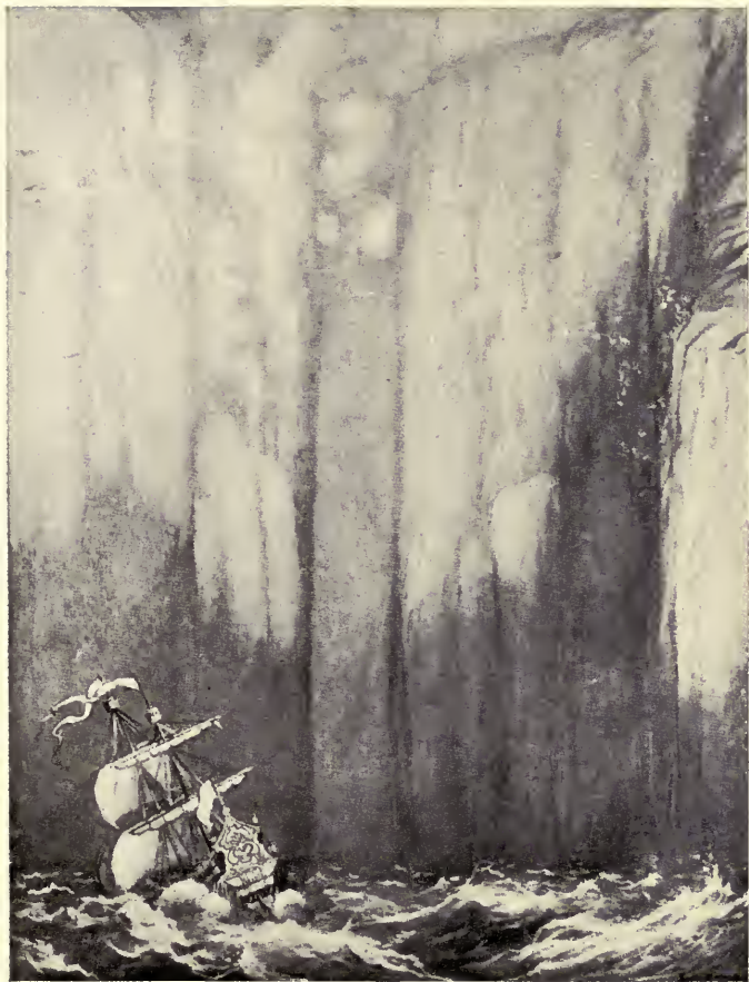
THE GATE OF YANN